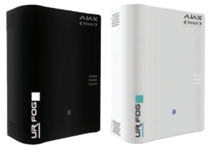
Wall or ceiling installation